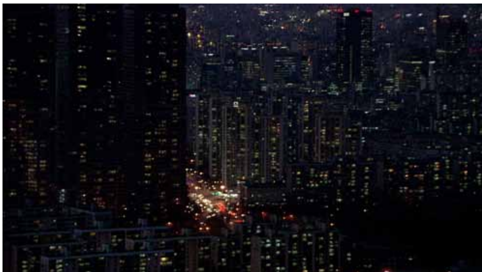
PHONE TAPPING Video HD 3D compositing, 10'20, colour, stereo sound, 2009