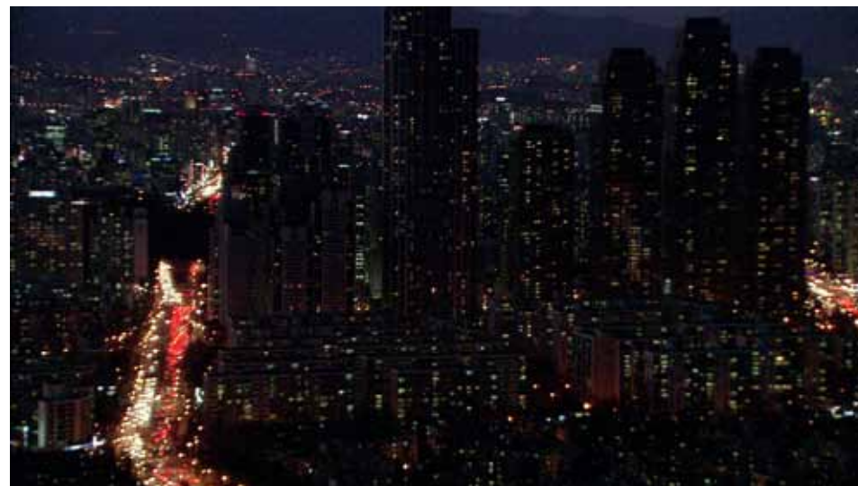
PHONE TAPPING production of The Fresnoy, National Studio of Contemporary Arts