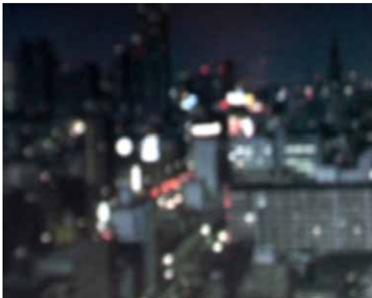
KARAOKE Video colour, stereo sound, 2009